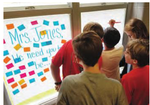
Figure 3.4 Seventh-grade boys add their sticky-note suggestions as well as read what others have written.